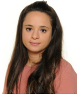
Miss Garaguso Otters