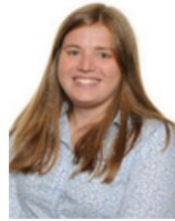
Miss Hill Badgers