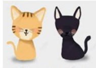
Being with her cats