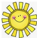
Spending time in the sunshine